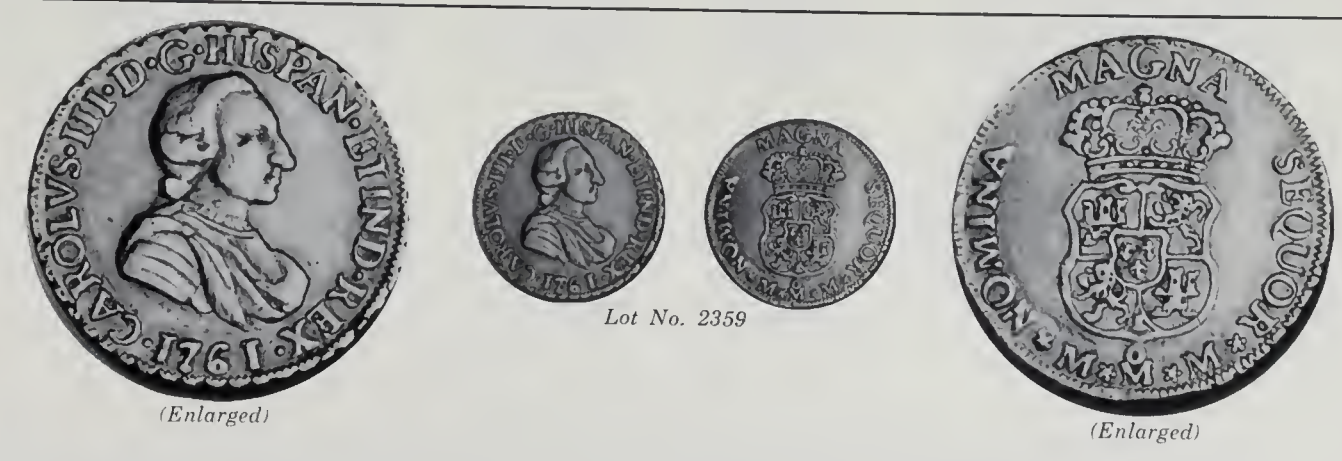
2 Escudos, 1761 Mo-MM. 1st Type. Similar to the 8 Escudos, but without the Golden Fleece on the obverse. C-T 405, Fr.28. An old reverse scrape below the shield, otherwise Very Fine. Rare. (1,500-2,000)

8 Escudos, 1761 Mo-MM. Small youthful bust type, as last. C-T 69, Fr.25. The second and rarer date of this type. An exceptional specimen. Extremely Fine. Very rare in this condition. (SEE COLOR PLATE) (10,000-12,000)